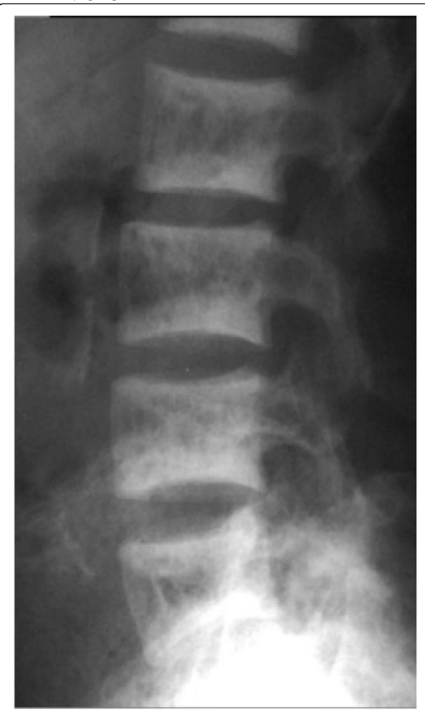
Fig. 2 Rugger Jersey Spine in Osteopetrosis. Images taken from radiopedia.org under creative commons license 3.0 [32]

termed 'osteoclast-poor') or in the mesenchyme cells that form and maintain the microenvironment required for proper osteoclast function (where osteoclast number can be high, i.e. 'osteoclast-rich' osteopetrosis, where the osteoclasts are unable to secrete acid) [33].